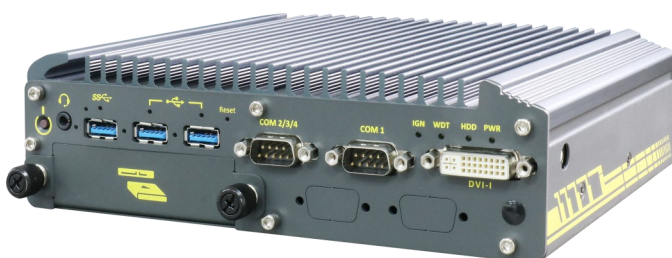
Nuvo-2610RL front I/O & rear